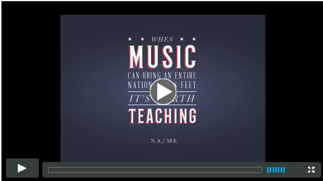
The Every Student Succeeds Act and Music Education Advocacy

How to prepare for a meeting with your elected representatives